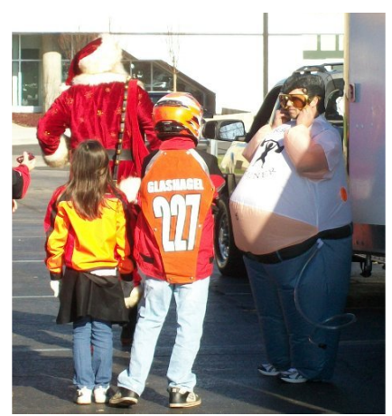
Elvis and Santa in the same photo?!? What am I doing writing for this rag? I need to sell this to the Enquirer!

idea, since the parade managed the brisk pace of 4 MPH - pretty fast if you're walking. Not to worry, folks - he made it to the end before Christmas.