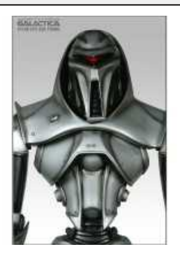
Battlestar Galactica Life-Size Cylon Centurion

Trouble with the neighbors? Unfortunately this life-sized Cylon robot isn't real and can't gun down the pests in your life, but it will give your spouse something to complain about when you put it in the living room. Especially when they see the $8590 price tag. www.nbcuniversalstore.com