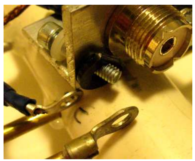
Fig. 2. Assembling the driven elements. The black nylon washer (note how the edge near the SO-239 is trimmed flat) and all the connections were made on the feedline side of the bracket, and the nylon bushing and the screw were fed through the hole from the other side.