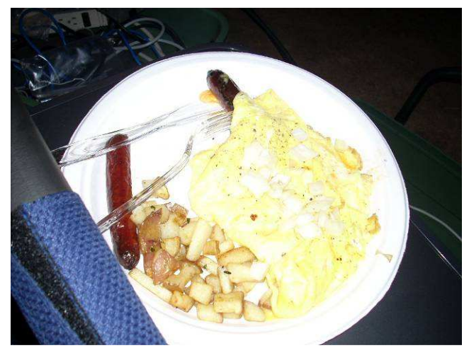
Fig 9. Breakfast by N9REP. Hopefully my cardiologist ain't lookin'!

Weather, for the most, part was in our favor. There were a few periods that we had to stop operations, as thunder storms crossed the area, but these were short lived and only interrupted our contesting effort briefly. During these short down periods we had an opportunity to discuss future efforts and improvements.