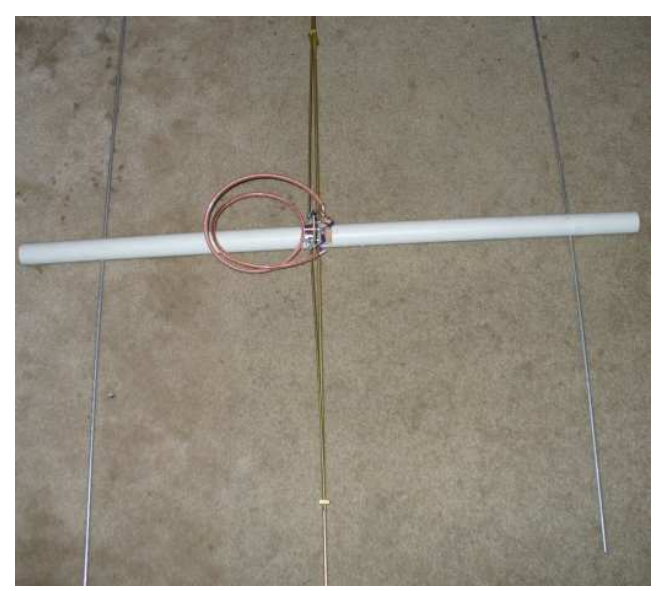
Fig. 7. The finished 2-meter antenna. We only used one director in the final design since it gave us a better SWR.

So how did we do? Did we accomplish our goal? The final total cost for all the materials, including all the trial and error, was about $65 for each set of antennas. That's not bad considering a small Cushcraft dual band beam costs $90 from Universal Radio. The often cited gold standard for portable satellite work, the Arrow antenna, has elements for both 2-meters and 440 MHz on one boom and costs $135, though it also comes with a small duplexer.