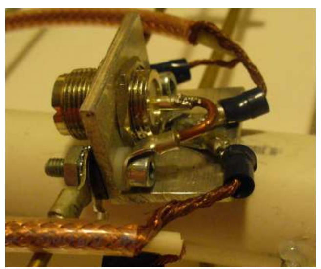
Fig. 1. The assembled bracket. Note the change to socket head screws. Even with the socket head screws, there still isn't much clearance to the bracket. You can also see in this photo that the center conductor of the SO-239 is connected to one side of the T-match by a very short section of solid 12-gauge wire. The coax balun connects to the other side of the T-match.

Getting everything assembled onto the bracket took some trial and error as well. Each side of the T-match needs to be insulated from the bracket, which is grounded to the shield of the feedline. We used nylon bushings and washers for insulation, but the washers had to be trimmed on one side to fit against the SO-239. As you can see from the next photo, we fed the nylon bushing through the holes and connected the center conductors of the coax baluns and the T-match wires, which were in turn connected to the driven element by the brass shorting blocks.