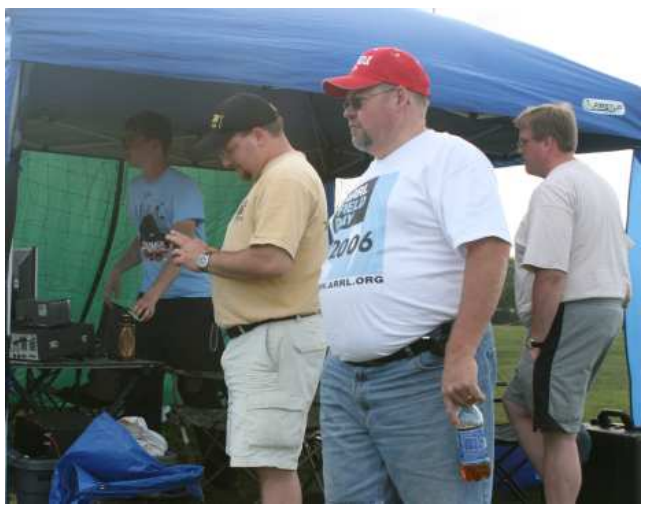
Fig 8. "If Joe doesn't get here with that pizza soon we'll have to eat Mark..."

Cutting out of Field Day early seemed to only enrage the mosquitoes. The swarms we battled as we dismantled all the stations and put the tents away were often of biblical proportions, especially if you had to get close to the trees to dismantle a kilometer long 80-meter antenna. We were able to make short work of everything – most of the antennas came down quickly and right before dark.