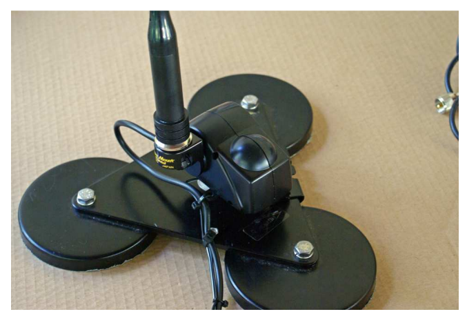
Fig 1. The antenna and motorized mount mounted to the DC Ace tri-mag mount.

So with the antenna and mount solved it was time to figure out how to get it on the car. As I mentioned previously there is no place to mount the antenna on a door as these areas are all plastic now, thanks Detroit or maybe Belvidere. It occurred to me that I had purchased a 3 magnet mount from DC Ace for mounting an HF antenna that wasn't being used as the magnets were too strong for the screw driver antenna's reed relay to work properly. So I looked at mounting the motor mount to this magnet mount and found out that this was the best solution.