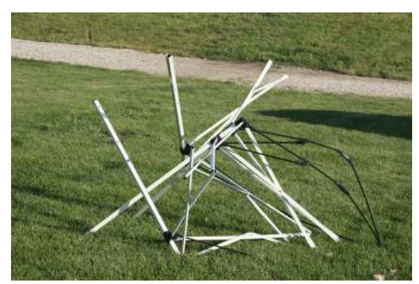
Fig 6. N9IFG's attempt at modern art. The wind helped.

GOTA/2-meter/6-meter tent threatened to blow away and take all of them to Oz.