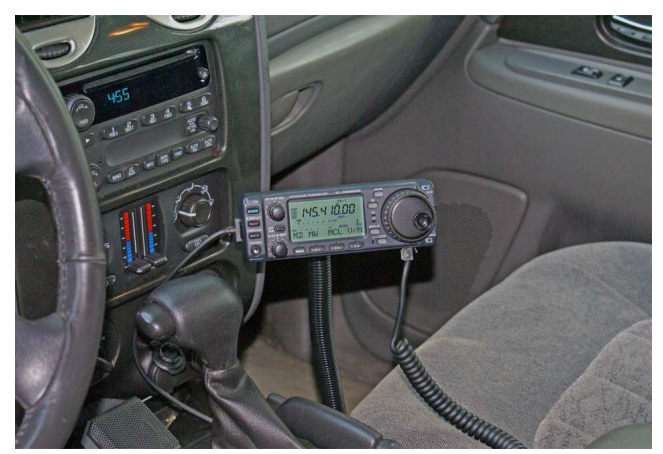
Fig 1. Icom 706 in the K9BTW mobile shack!