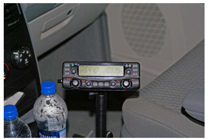
Fig 3. Icom IC-2720 in the K9TMS work vehicle.

The Lido Mount has definitely solved the issue of where to put the radio and more importantly gets the remote head where it can easily be seen and played with. If you have a radio with the ability of remote mounting the head this mount is well worth investigating! Cost is around $30 from AES.