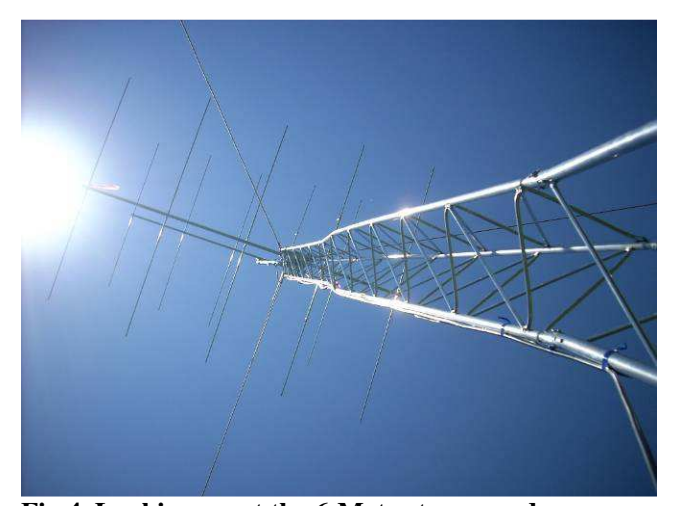
Fig 4. Looking up at the 6-Meter tower and array.

Our Six meter station, although the same equipment for the most part as last year, has been improved with a Universal Tower getting the stack of two 5-element beams up to 32 and 46 foot heights. Another new addition here was the use of the Penninger mast. Problem was we need to have at least 18 feet of mast for the antennas yet were not able to transport this length of mast to the site. Using the mast from Penninger we had one 10 foot section and one 8 foot coupled with one of his mast clamps. The assembly performed better than I had hoped.