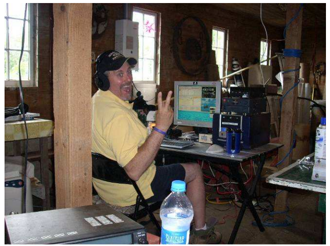
Fig 3. Two points for each 432 QSO, right?

Our Six meter station, although the same equipment for the most part as last year, has been improved with a Universal Tower getting the stack of two 5-element beams up to 32 and 46 foot heights. Another new addition here was the use of the Penninger mast. Problem was we need to have at least 18 feet of mast for the antennas yet were not able to transport this length of mast to the site. Using the mast from Penninger we had one 10 foot section and one 8 foot coupled with one of his mast clamps. The assembly performed better than I had hoped.