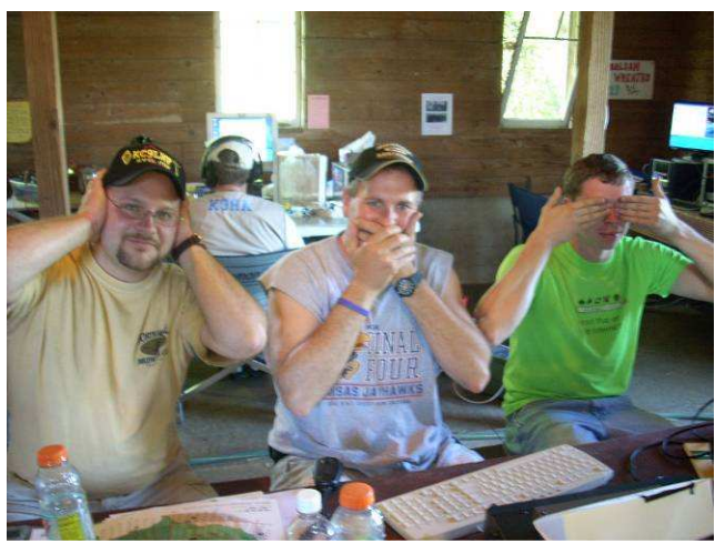
Fig 1. Hear no evil, speak no evil, and see no evil???

The Stoned Monkey VHF Amateur Radio Club was active from EN52uj near McHenry, IL. It is hard to believe how far this group has come in a short period of time. I was September 2006 that we submitted our first contest log with a group of only about 6 to 8 at the time. Our common goal has always been to do the best that conditions allow us, and, if at all possible, do better than we did last time. The group has grown now to 14 and has managed to go out and better their performances of June 2007 and September 2007. One of the things that most impressed me was the number of younger hams that have joined the group as well as the older gray haired hams teaching the art of VHF contesting to the new comers. Result – we all had a great time!