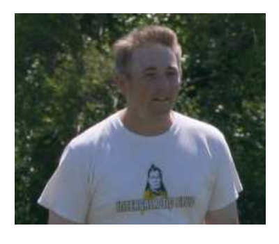
Fig 1. Conditions were breezy even early on. Is that just the wind or an Elvis pompadour? Only my hairdresser knows for sure!

Despite there being some confusion as to where different stations would go, Joe N9IFG and I found the longest piece of real estate we could find and went about erecting our 80-meter antenna – a 300-foot long modified double-ended Zepp. You can tell a lot of people how long 300 feet is; it's as long as a football field or about four tractor trailers, but you really don't get an appreciation for it until you put up an antenna that long. Things started looking up when I brought my TS-850 out of the case and found it working well on 80-meters despite a less-than-ideal SWR of 2.6:1 through about 200 feet of somewhat lossy coax.