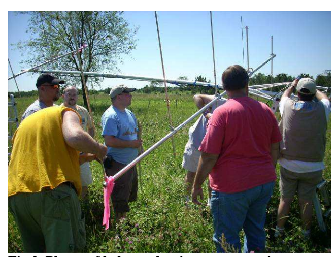
Fig 2. Plenty of help on the six meter array!

The bands for the most part were in decent condition. Especially Six! Six was open pretty much the entire run of the contest with contacts across the USA, Canada, Bermuda and Virgin Islands. This is the first time I can recall this many contacts on six that have been out of the 48 states area. One of the really neat things that happened was when one of our new Hams managed to snag the Maritime Provinces in Canada, not a big deal to some of us Gray Hairs but this Ham's first contact outside the USA. His reaction that he had also managed to work VP9GE in FM72 in Bermuda was somewhat delayed until he was able to get a close look at the grid map!