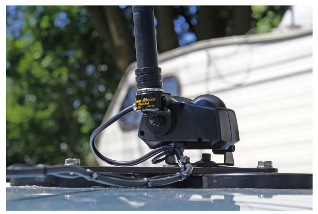
Fig 2. The finished solution on top of the van.

My initial results seem to be very good as the signal strengths have been on par with my old antenna system. The motor mount does a great job of lowering the antenna in a matter of only a few seconds to allow you under that low ceiling in the garage or to get that Double Quarter with Cheese at McDonalds without rearranging your antenna.