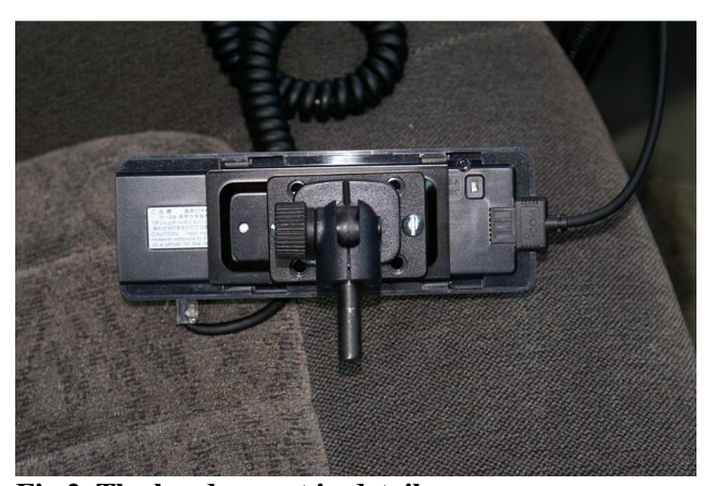
Fig 2. The head mount in detail.

When my Town and Country arrived I found that I was also faced with the dilemma of where the heck to mount a radio. First I tried the HT and small amplifier. This worked ok, but with only 30 watts, I had nowhere near the range of the 50 watt radio I was so used to. So I decided it was time to invest in this mount as well to mount the Icom 2720 I have for my company car. Unfortunately I never really invested in a mounting plate for the radio so I was forced into making my own. A small piece of aluminum and some longer M3 screws did the trick nicely. I also found that if you want the remote head cable can be nicely hidden inside the protective sheath that is supplied around the goose neck; a nice touch to neatening up the wires. It was just a matter of placing the radio out of the way on the floor behind the driver seat and all was well. With my radio so close I didn't have to go to the extent of remote mounting a speaker like Dan did so the installation was a bit quicker in that regard.