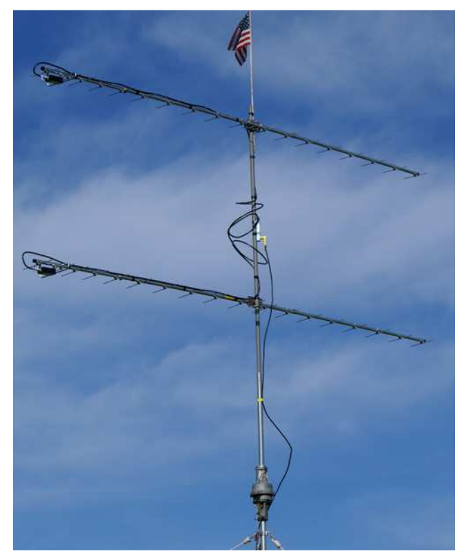
Fig 6. The 432 antenna stack.

On 222 and 432 we made some significant changes in our efforts to always improve things. This time out we stacked antennas on 222 with a pair of 15 element boomers, as well as a stack of 19 element boomers on 432. The improved antenna systems really pulled in the weak ones!