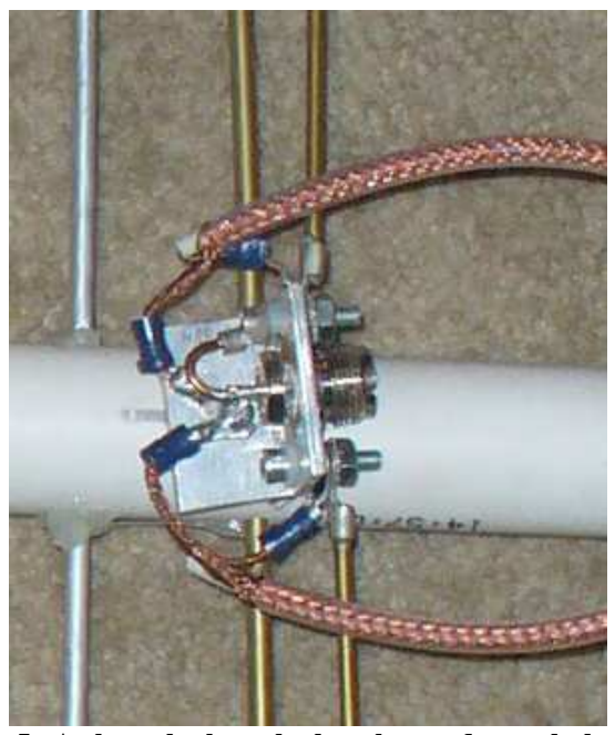
Fig. 5. A closer look at the bracket and coax balun of the 440 MHz antenna. The center conductor of the SO-239 is connected to one side of the T-match. The center conductor of the coax balun connects each side of the T-match together. If you build an array of similar antennas and stack them together for more gain, make sure to connect the center of the SO-239 to the same side of the T-match on each antenna to maintain a proper phase relationship. You can also see that each element is secured to the boom with hot glue.