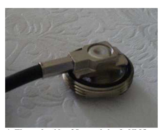
Fig. 1. The underside of Larsen's beefy NMO mount and the flowery print on the pad of the author's dining room table.

When I got the mount I was impressed by its sturdiness. Compared to your standard issue NMO mount this seemed indestructible. The added heft made installation a little easier since I didn't have to worry nearly as much about twisting or breaking the connection when I tightened it down and made sure it was in contact with bare metal on the underside of the roof.