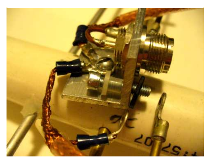
Fig 3. Another look at the bracket assembly. In this photo you can see the shield of the coax from the impedance matching section grounded to the bracket. Each side of the center conductor is attached to each side of the T-match.