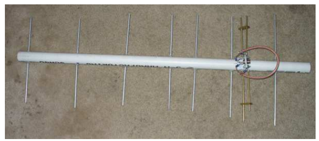
Fig 6. The finished 440 MHz antenna. The coax balun is secured behind the driven elements in both of these antennas. Putting the balun in front of the driven element will lead to a high SWR in the neighborhood of 3:1.