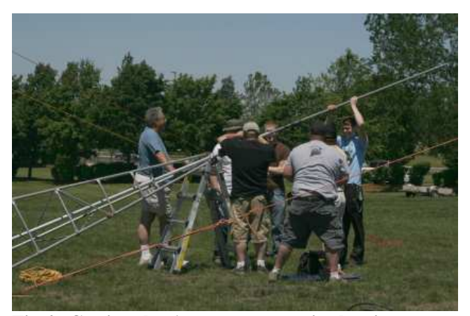
Fig 4. Getting the 6-meter antenna in the air.

It was shortly after 1PM when we were finishing up the VHF antennas. Since the 80-meter station was up and running with the exception of the computer, I couldn't wait to make my first contact with my TS-850. At 1:20 I sat down at the radio and searched and pounced. I worked about five stations within a couple minutes. "Not too bad!" I thought, expecting the activity to continue. Unfortunately, it didn't. Alternating between calling CQ and tuning around didn't help much and I think I worked about 3 more stations in the next hour. Terrible atmospheric noise made working some stations difficult, and the band was mostly dead. Other operators reported the same conditions – more static crashes than stations heard due to strong ORN.